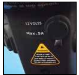
Handy 12 volt socket

Overall Dimension : A x B x C 130 x 69 x 125cm/51 x 27 x 49"