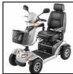
Modern LED lighting system