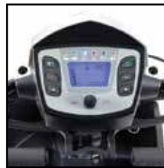
Digital LCD dashboard display