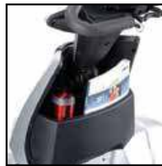
More space for storage