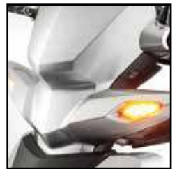
Modern LED lighting system