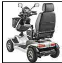
Modern LED lighting system