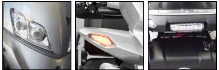
Modern LED lighting system delivers brilliant light with less power consumption