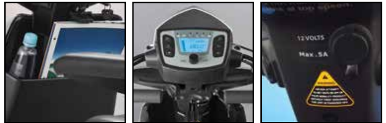
More space for storage